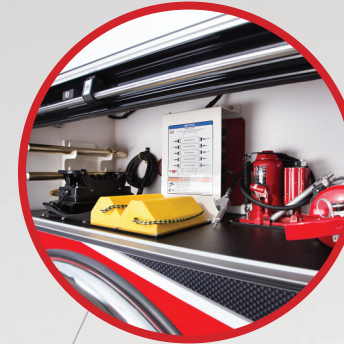
WHEEL CHOCK, FIRE EXTINGUISHER & BOTTLE JACK STORAGE