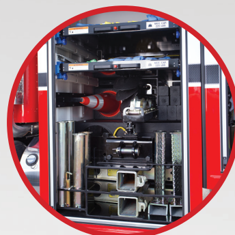
TILT-DOWN DRAWERS, TIRE LIFT, TRAFFIC CONES, CRIBBING, RATCHET, BROOM & SHOVEL STORAGE