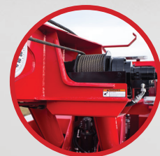
20K AUX. WINCHES (OPTION)