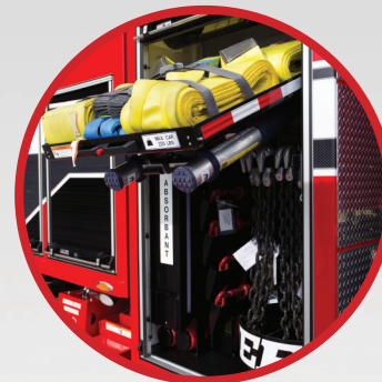
TILT-DOWN DRAWER, CHAIN CAROUSEL, CHAIN BINDER & STAY-DRY STORAGE