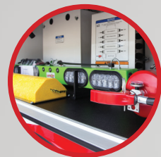
TOW LIGHT STORAGE & CHARGING STATION

Its extra-rugged, non-corrosive exterior is made of weather-tight, impact-resistant polypropylene—making it more durable and longer lasting. It features roll-up aluminum doors for swifter access to equipment, strategically placed LED lighting for improved visibility and specialty storage solutions to ensure every tool has its place.