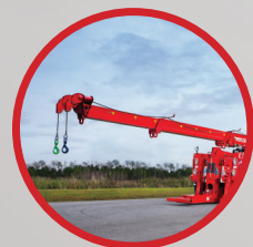
3-STAGE WRECKER BOOM