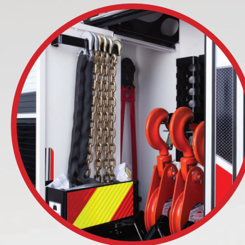
SNATCH BLOCK STORAGE & SLIDING CHAIN BOARD