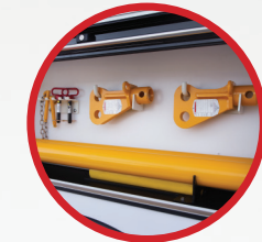
SPREADER BAR STORAGE