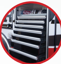
TOOL BOX WITH LOCKING DRAWERS