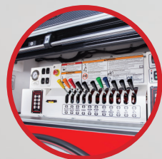
DRIVER & PASSENGER SIDE CONTROL PANELS