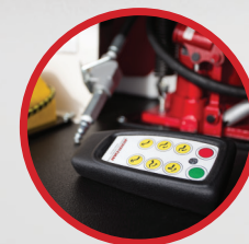
WRECKER BOOM & UNDERLIFT REMOTE CONTROLS